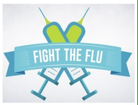
Speak to a member of our team and book your flu jab today!