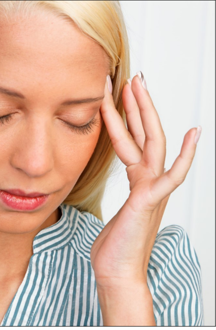
ID 8429623 C Ginasanders | Dreamstime.com

usually happen one to four times a month. Along with pain people have other symptoms such as sensitivity to light,